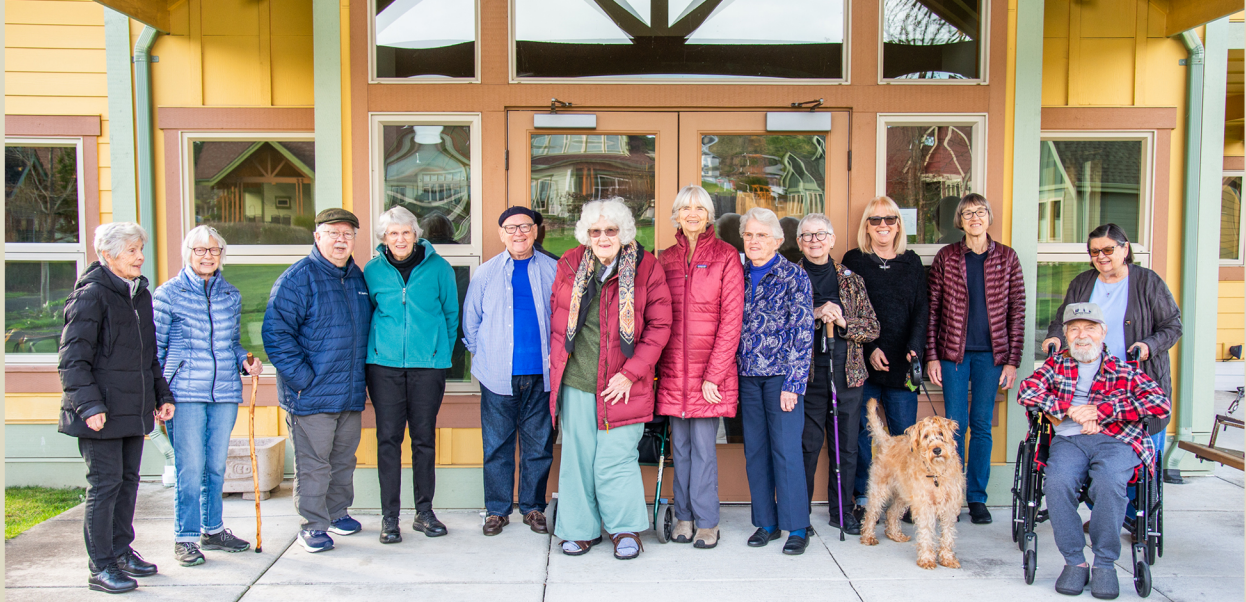
Cottage residents meet in front of the Gathering Place for a fall photo.