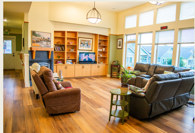
New luxury vinyl plank flooring is now installed in the common areas of Hamlet House, thanks to the benevolence of Hamlet donors.

We've worked hard to identify opportunities for growth, better delivery, and sustainability, all while ensuring that we stay true to the values that have always defined us. We are excited to continue this work into the future!