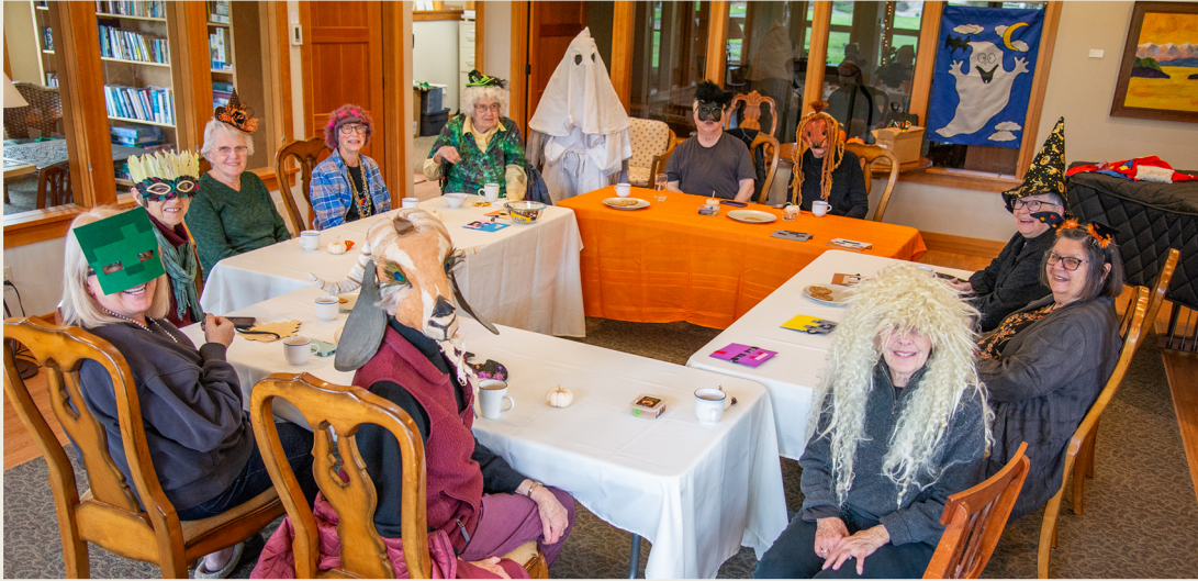
Cottage residents celebrated Halloween in the Gathering Place.