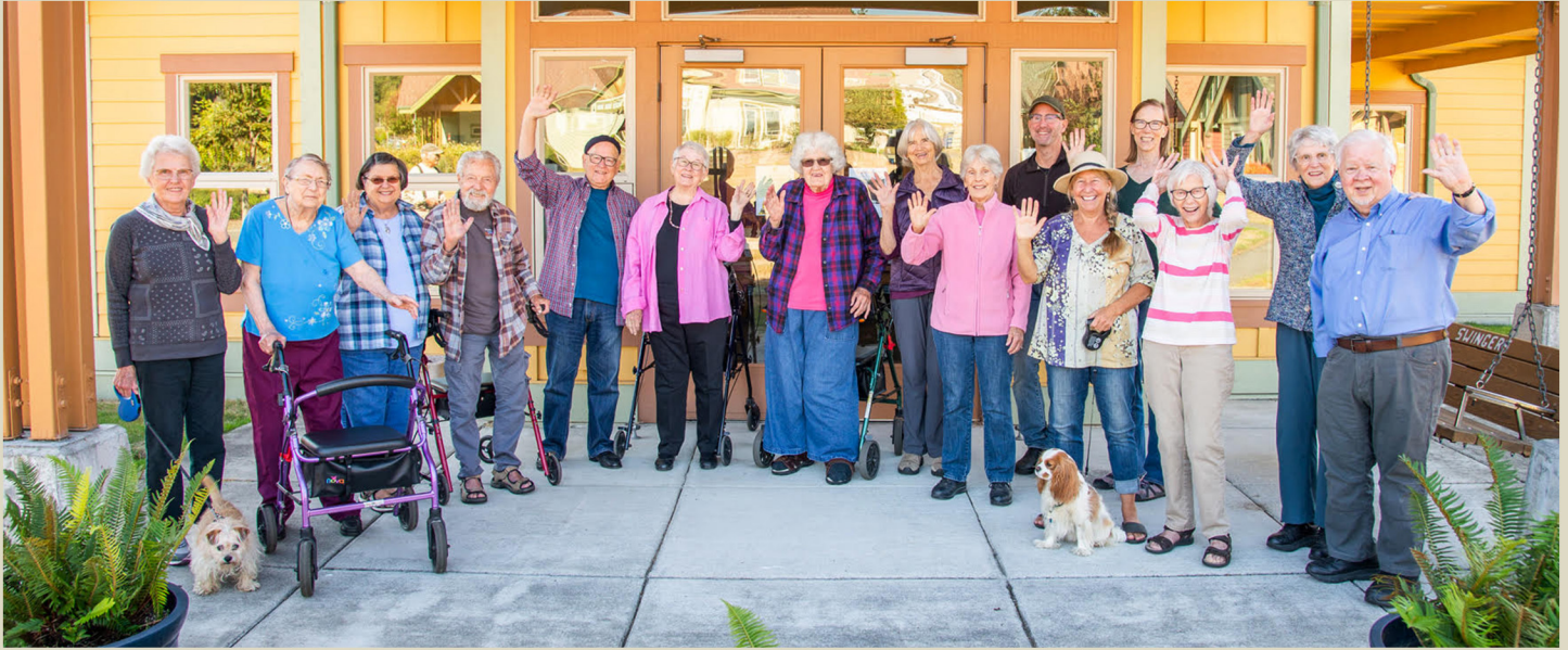
Cottage residents in front of the Gathering Place for a fall photo.