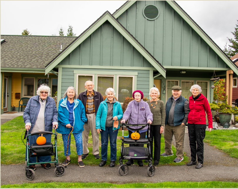
Some of the Cottage residents posing for a photo on a brisk fall day.