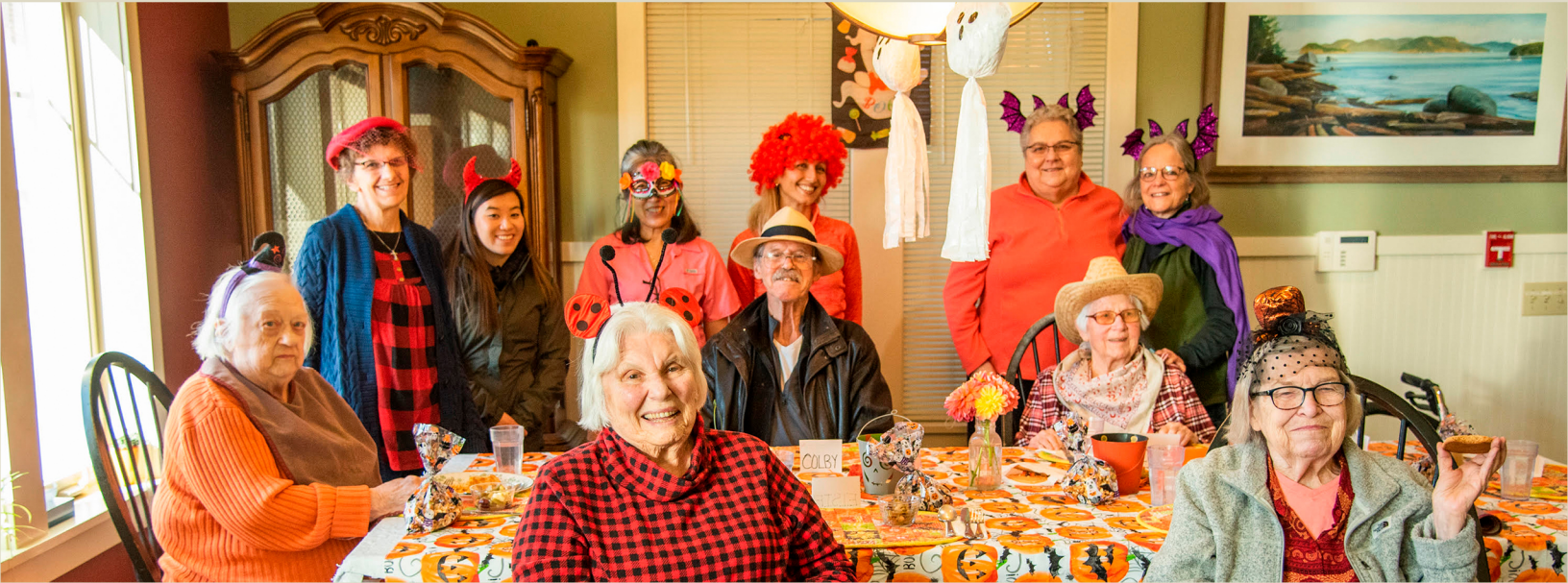
Halloween lunch at Hamlet House (staff unmasked briefly for a quick photo).