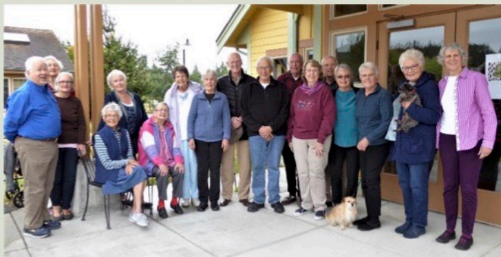
The Cottage Residents and their four-legged friends