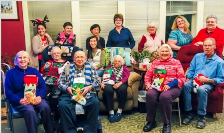
Getting into the holiday cheer at Hamlet House!