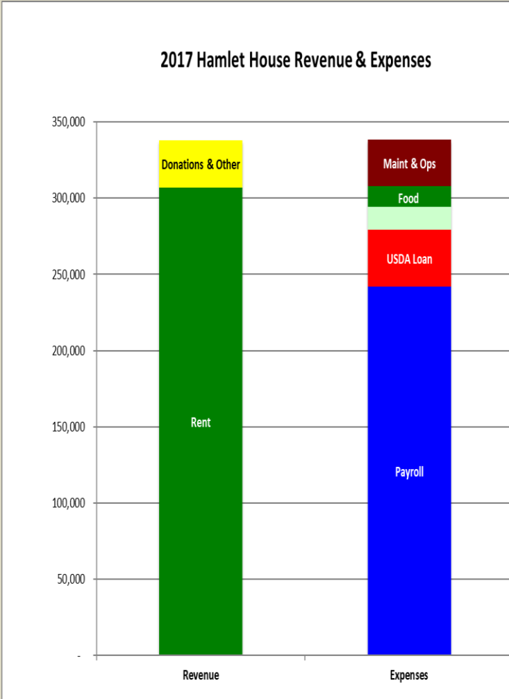
2017 Hamlet House Revenue & Expenses

Hamlet House occupancy was almost 95% in 2017. However, staffing costs were higher than anticipated resulting in a revenue shortfall.